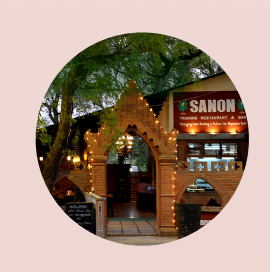
Our Address: Pyu Saw Hti Street, next to Nyaung U Thante, Bagan, Myanmar